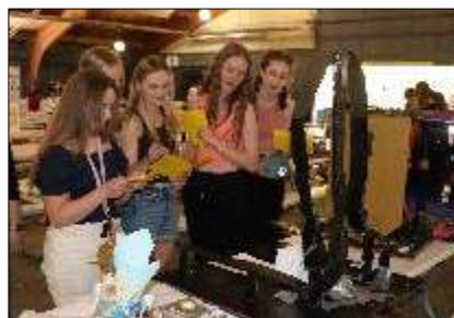
Students looking at a Ride Design Contest entry.

A primary activity at Physics Day is the Student Laboratory Workbook which is designed to encourage participation from all the students attending. USU has developed this year's Student Laboratory Workbook with a mixture of very simple and more challenging questions on a number of the rides at Lagoon. Separate workbooks for high school and middle school students are available on the Web. Alternately, teachers can custom design their own student workbooks by selecting from dozens of activities, allowing teachers to tailor their students' activities to their own curriculum needs. Teachers are responsible for providing copies of the Workbook to their students. USU will collect the Workbooks and return them to the teachers (with solutions) at the end of Physics Day. Prizes will be awarded on a random basis to students who turn in their workbooks. No student registration is required for the Student Workbooks.