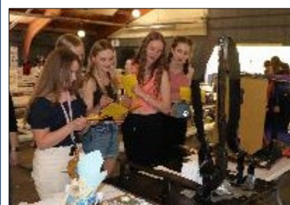
Students looking at a Ride Design Contest entry.

A primary activity at Physics Day is the Student Laboratory Workbook which is designed to encourage participation from all the students attending. USU has developed this year's Student Laboratory Workbook with a mixture of very simple and more challenging questions on a number of the rides at Lagoon. Separate workbooks for high school and middle school students are available on the Web. Alternately, teachers can custom design their own student workbooks by selecting from dozens of activities, allowing teachers to tailor their students' activities to their own curriculum needs. Teachers are responsible for providing copies of the Workbook to their students. USU will collect the Workbooks and return them to the teachers (with solutions) at the end of Physics Day. Prizes will be awarded on a random basis to students who turn in their workbooks. No student registration is required for the Student Workbooks.